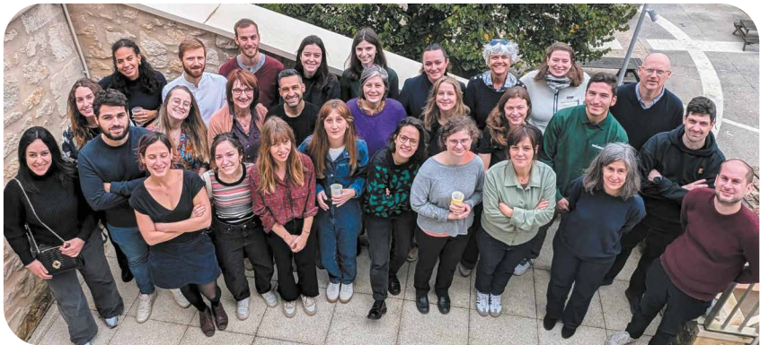
The Avise team attending a seminar in Bordeaux in November 2024

A team of around thirty committed professionals with the shared goal of addressing major societal challenges by “enabling new forms of entrepreneurship” and leveraging social innovation.