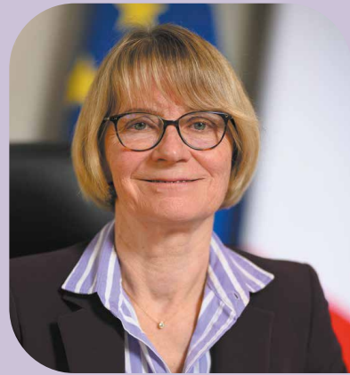
Véronique Louwagie, Minister Delegate for Trade, Small-Scale Industry, Small and Medium-Sized Enterprises and the Social and Solidarity Economy.

First of all, I would like to say that implementing this French SSE strategy is a priority for me. We have leveraged resources and involved many administrative and local bodies to make it happen. At this stage, the priorities for the national SSE development strategy have - intentionally - not yet been defined. We have chosen to join forces with stakeholders, funding organisations, local authorities and citizens to develop it. This is why we have put in place a local, national and public consultation process across France. To give everyone a chance to share their opinion freely, this consultation focusses on four main areas: governance, funding, transitions and development.